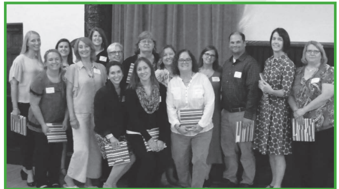
Many of the 15 year honorees.